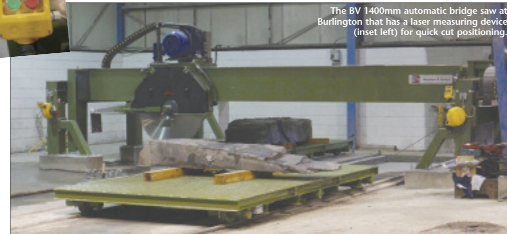
The BV 1400mm automatic bridge saw at Burlington that has a laser measuring device (inset left) for quick cut positioning.