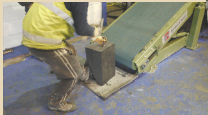
These three pictures show the specially adapted BV 1200mm heading machine New Stone Age has supplied to Cumbrian stone quarry and processing company Burlington. The heading machine is reducing waste by processing small blocks (or cloggs) that were previously discarded. It is being used in the process of turning them into setts and small roofing tiles.